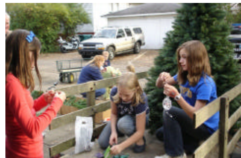
NMGMS kids decorating prize-winning float.